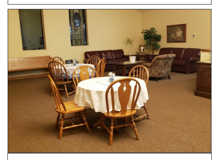
Let's get together for a cup of coffee, visit, and renew old friendships at the stevne.

Check the address label on the back page. If it says "Paid through 2024" your membership is current. If not, we would love to have you renew your membership. See page 10 for the membership form.